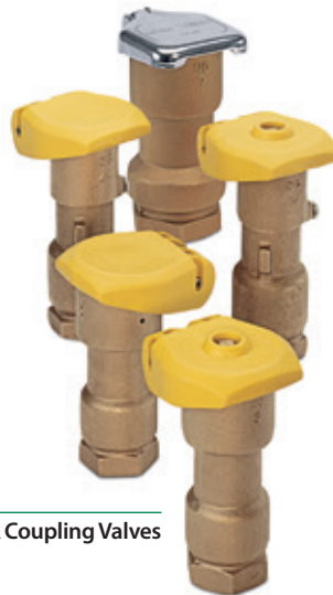
Quick Coupling Valves