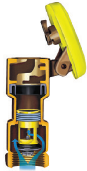
Quick-Coupling Valve Cutaway