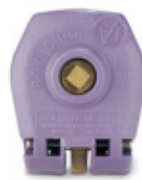
33-DNP, 44-NP, 44-NP ACME