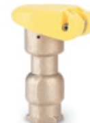
3-RC, 5-RC, 5-LRC