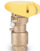
33-DRC, 33-DLRC, 44-RC, 44-LRC