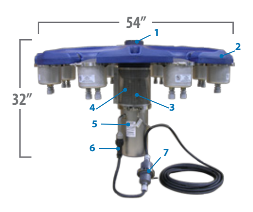
1 - 5 HP Masters Series Vertical Design ( Min. Operating Depth - 3ft.)