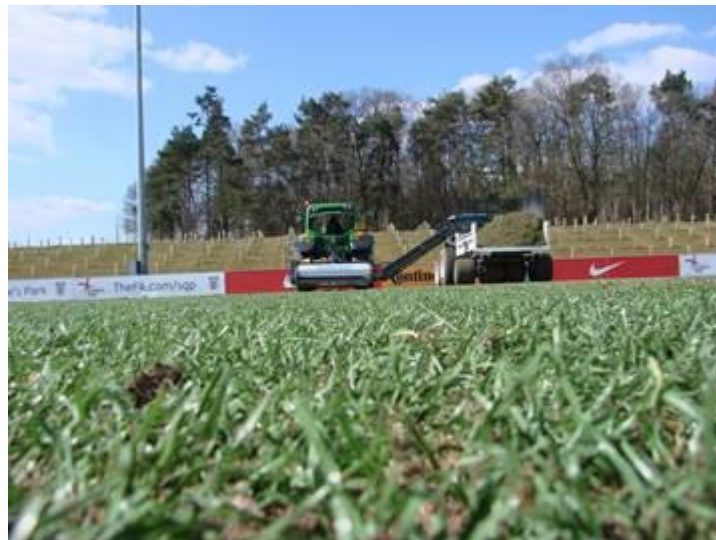
Koro FTM with Universe® rotor working on Desso close up of surface

The Universe® rotor consists of four spirals with hooked tungsten tipped blades 10 mm wide