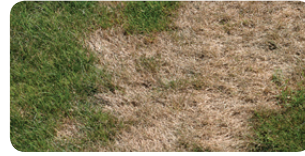
Seedling Damping Off