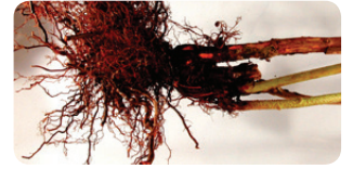
Crown and Root Rot