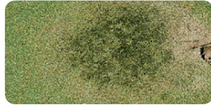
Pythium Root Rot